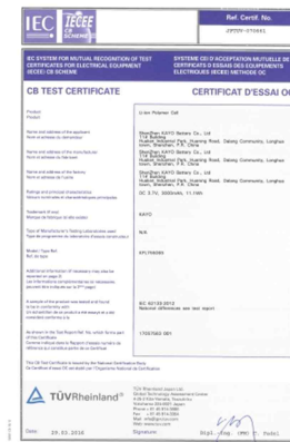
CB 2 nd Edition