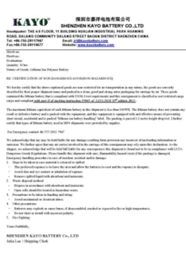
Non D.G letter